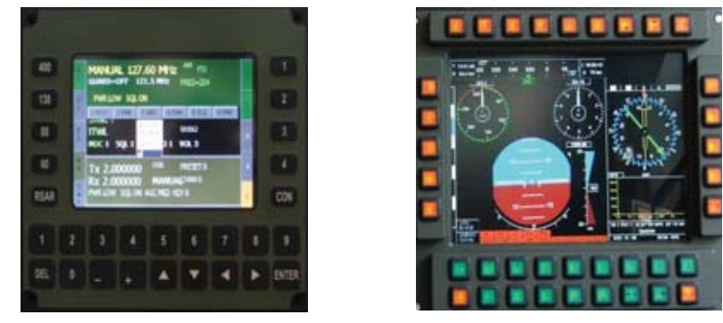
Fig. 3. The PSL-1 control panel (left) and the MW-1 multi-function display (right) included in the ITWL-developed integrated communication systems

communication server, control panels, the radio station set) are interchangeable and can be used on helicopters of different types. By the way of example, the integrated avionics system (the so-called macro-system) has been built into the W3-PL helicopter; the integrated communication system is one of the components thereof [3]. This one is the most 'expanded' version of the integrated communication system ZSŁ built into a military helicopter operated by the Polish Land Forces. It comprises, among other items, the digitally controlled radio stations of the RRC, HARRIS, and MR6000 types; and three displays of the MW-1 type (for the commander, the co-pilot/operator, and the cargo/troop compartment commander).