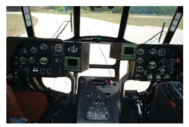
Fig. 1. The cockpit with components of the ITWL-developed integrated communication system ZSL-1 built into the Mi-8 helicopter

co-pilot/navigator (right station) can use the radio communication system simultaneously and select the mode of operation of radio navigation devices in the range of the so-called navigation signals from the VOR, ARK, TACAN, and MRK systems [4].