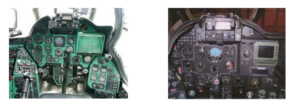
Fig. 2. The cockpit with components of the communication system in use until now (left) and the ITWL-developed integrated communication system ZSŁ-1 (right) built into the Mi-24 helicopter

In the Mi-24 combat helicopter, the components of the integrated communication system have been arranged in a different way because of the tandem (with lower and upper pilot seats) cockpit configuration. However, it does not affect the functioning of the whole system.