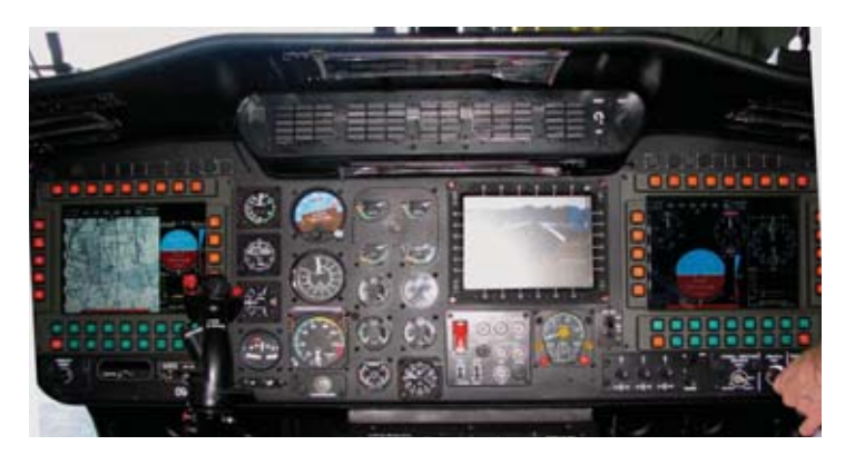
Fig. 4. The cockpit with components of the ITWL-developed integrated communication system built into the W-3PL helicopter

The W-3PL cockpit (Fig. 4) is outfitted with two multifunction displays MW-1 that control the communication system, inform of the operational status of particular radio stations and whether/to what extent other components of the integrated avionics system remain fit for use. Selection of the mode of operation depends on the aircrew decision. Every aircrew member has their own display with a visual representation of a complete set of data essential to perform the mission. All the data are visually represented on these multi-function displays in a fully independent manner.